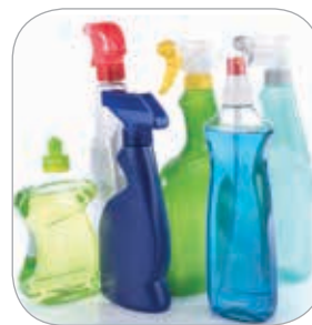
Home Cleaning Products