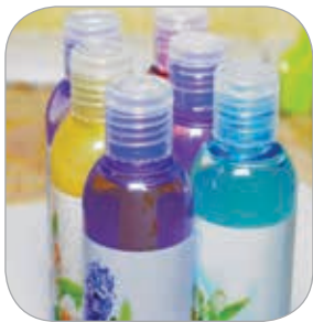
Bath & Shower Care

Hardy process weighing solutions support the Consumer Packaged Goods (CPG) manufactures of an immense assortment of household and personal care products such as: