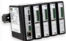
Hardy HI 6600 Modular Sensor System