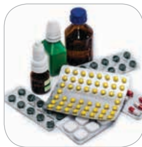
OTC Drugs & Vitamins