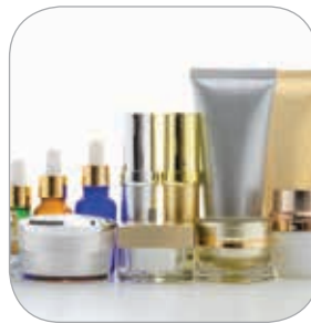
Cosmetics & Cosmeceuticals