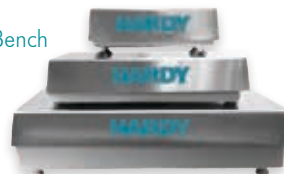
Hardy Bench Scales