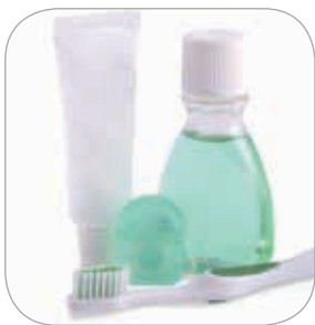
Dental & Oral Care